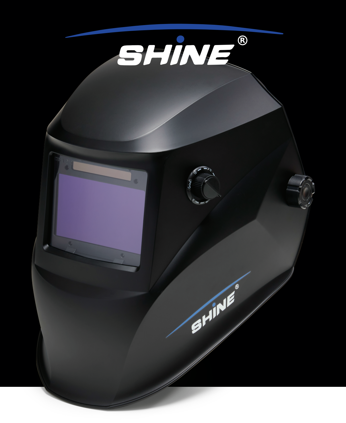
SHINE 5000X WELDING HELMET