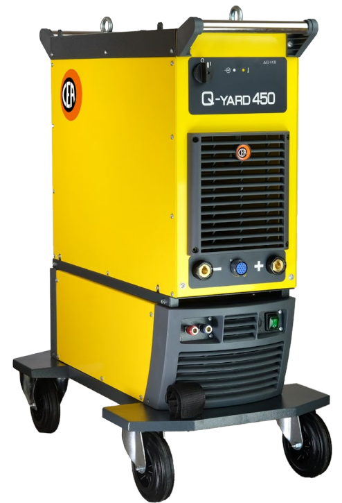
QYARD 450 with WK3 kit and HR32 water-cooler unit