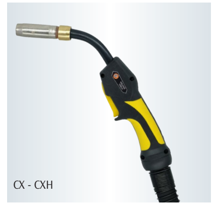
CX - CXH

Thanks to an additional synchroniser PCB kit (optional) it's possible to use push-pull torches up to 12m length, that keep the wire speed control constant during all the process.