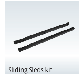
Sliding Sleds kit