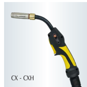
CX - CXH

Thanks to an additional synchronizer PCB kit (optional) it's possible to use push-pull torches up to 12m length, that keep the wire speed control constant and regular during all the weld.